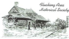
Flushing Area Historical Society

Presented by Flushing Area Historical Society & the Script "A" Club